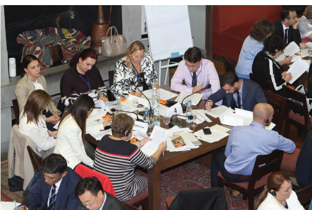
Everybody at work

The Working Group developed the RA Guide as annual planning (RAP) methodology, representing a step-by-step guide, using good practices of the various RA Methodologies from IACOP countries and internationally. A case study was also developed to be used as a training material on the subject of RA. The case study and the RAP Guide are already used for training purposes in many countries, and was first introduced in Hungary and Moldova. The key performance indicator (KPI) used by IACOP to monitor the use of the Risk Assessment methodology showed significant impact and progress from zero score in 2007 to scores of 10-12 out of 20, in 2014.