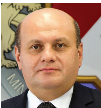
Nodar Khaduri Georgian Minister of Finance

"Georgia highly appreciates PEMPAL activities. My country has benefited from participating in this program directly."